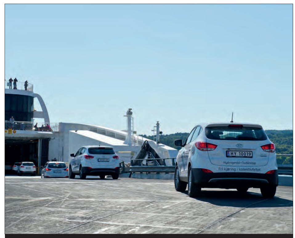
The fleet of Hyundai ix35 Fuel Cell SUVs set off from Bergen in Norway, refueling in Porsgrunn en route to Larvik, where the cars boarded the ferry for the crossing to Hirtshals in northern Denmark. (The 'HY' prefix on Norwegian vehicle plates denotes hydrogen-powered vehicles.)

The ix35 Fuel Cell is being thoroughly tested on European roads. Last summer one of the vehicles was driven for 2383 km (1481 miles) in 24 hours on public roads in Germany, only stopping to refuel [FCB, September 2015, p2], and earlier this year another vehicle completed nearly 52 clockwise laps of the M25 London